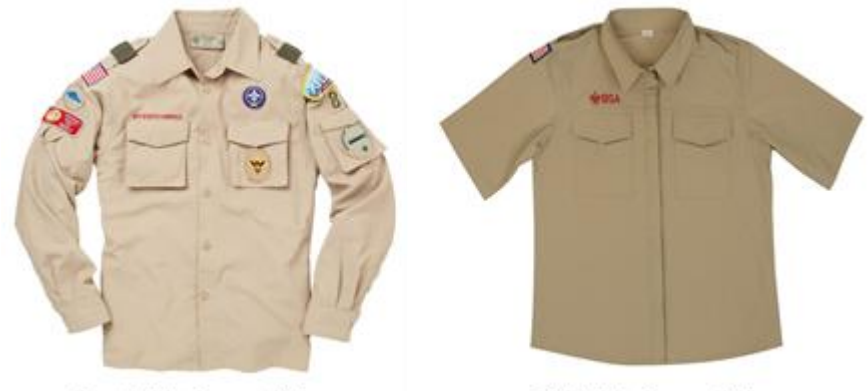
Boy's Uniform Shirt

Troop 4024 Scouts wear the official BSA uniform shirt (known as a Class A) consisting of the following: